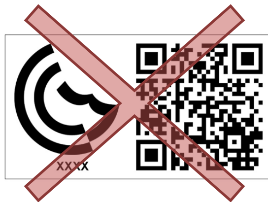
Fig.0: Configuration of the previous GCTS for Products

If the Economic Operator wishes to update the GCTS on the products to the new format before the renewal of the certificate (“running change”), they may do so on voluntary basis and shall contact the Notified Body issuing the certificate to obtain the new GCTS in electronic format as generated by the GSO Conformity Tracking System.